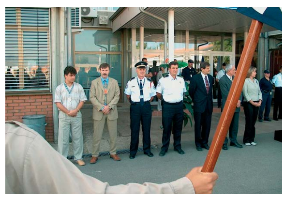
Picture1: Training at the Kosovo Police Service School, 2004

In referring to 'partnership' policing it needs to be understood that CBP implies a new contract between the police and the public they are there to serve. It seeks to reverse resentment, apathy and opposition to the police