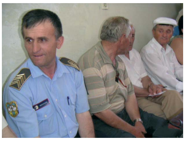
Picture 2: Community Problem-Solving Group in Vlora, 2004

CBP seeks to transform the culture of the police, increase their capacity and improve police-community co-operation in order to prevent crime, increase community safety and enhance sustainable development. In this effort, controlling the availability and circulation of SALW is a vital issue. The easy availability of SALW can turn domestic or